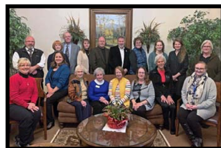
IAC Grant Recipients FY2020

$5,000.00 Richmond Shakespeare Festival, Inc. | Wayne