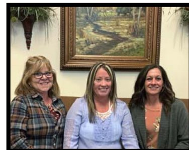
Huntsville Community Center