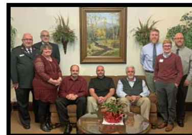
2019 Local Grant Recipients

$2,400 | Youth Service Bureau of Jay County | for the B.A.S.E. Program ($1,800 awarded from the Community Foundation Enrichment Fund and $600 awarded from the Union City Community Fund)