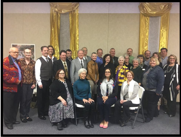
Art Grant Recipients

The Indiana Arts Commission recently awarded $207,121 in grants to arts organizations and arts projects in Region 5 for the 2018 cycle. Region 5 includes Blackford, Delaware, Fayette, Grant, Henry, Jay, Madison, Randolph, Rush, Union and Wayne counties.