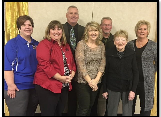
Local Grant Recipients