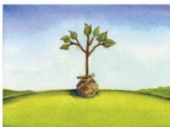
Donors make gifts to the Foundation