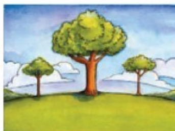
Gifts are invested; the value grows.