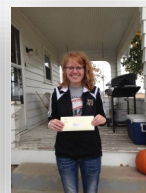
Brit's Wonderful Learners