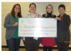
MC Jr-Sr High