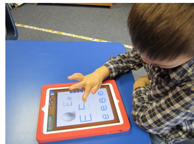
YMCA Pre-school student playing with an iPad purchased through a CFRC grant

Thank you to all who helped these organization meet their goals.